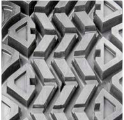
350 MAG 6

All-purpose tires driven over any terrain and asphalt too, hauling cargo at a jobsite or driving off-road just for fun. OTR's line-up includes tires preferred and used on OEM equipment that are proven with end users. Some of our most popular models—350 Mag, 350 Super Mag and Prowler—are designed specifically for versatility, ruggedness and comfort.