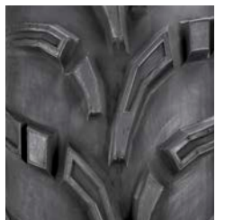
440 MAG 7