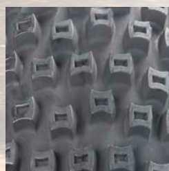
250 SWIFT 12