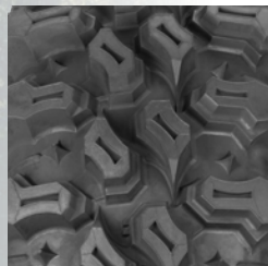
ROCK JAW 8