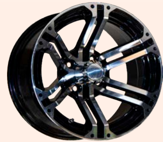
OTR custom 14" and 15" wheels for UTV applications--available for aftermarket use.