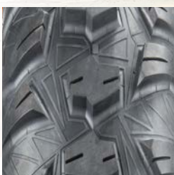
PRO TERRAIN 11