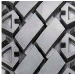
350 SUPER MAG 6