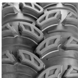
DIRT MASTER 10

All-terrain tires work for any off-road surface. Whether driving through mud, muck, water or sand, tires like the Wizzard, Trail Warrior and HP-009 keep you moving forward, safely and comfortably. These tires were designed for durability, stability, versatility and a smooth ride.