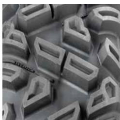
WIZZARD R2 11