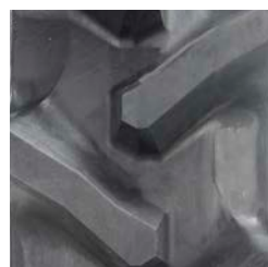
BIG FOOT 9