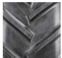
22 MAG 9